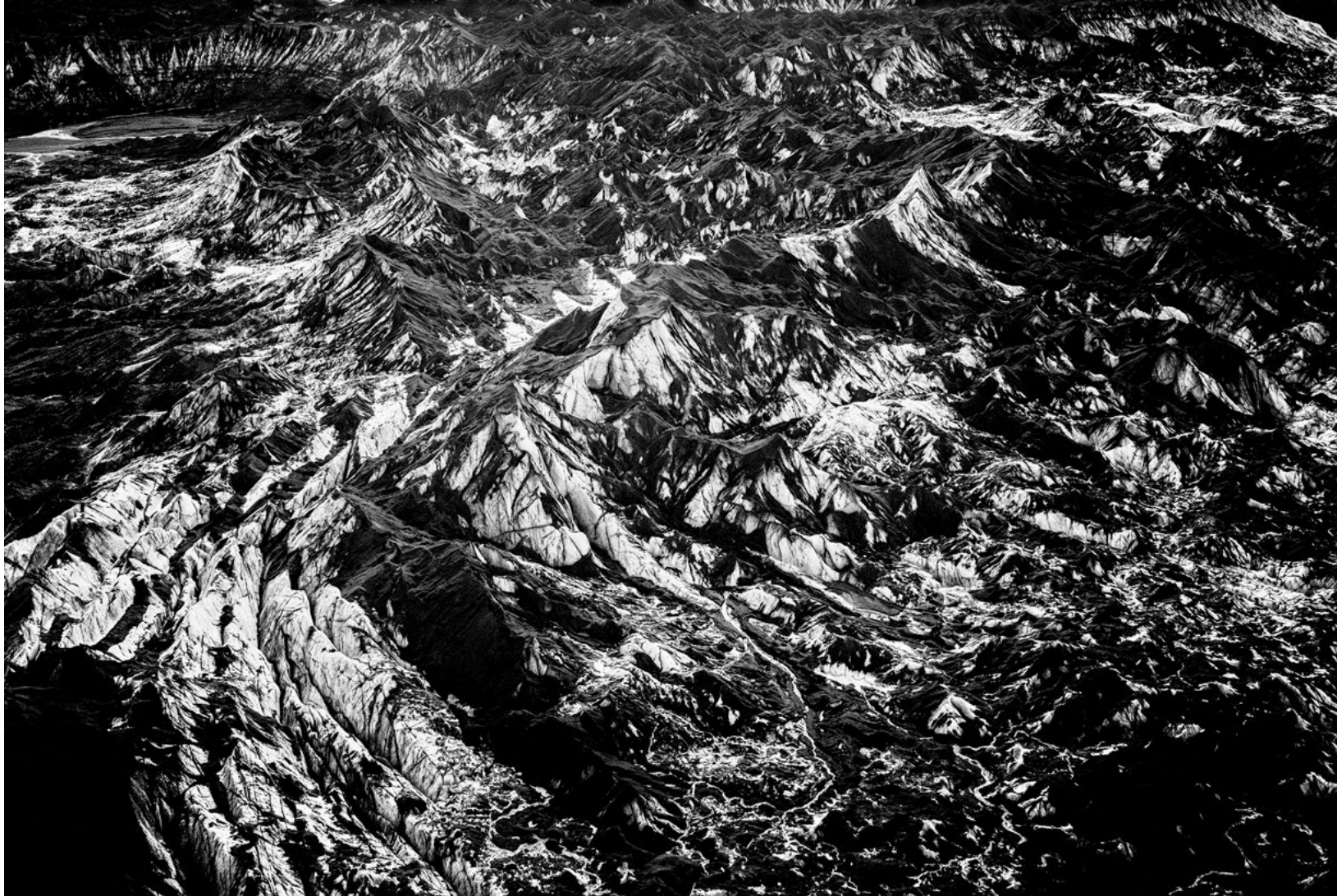
Ragnar Axelsson Köttljökull, Iceland, 2022