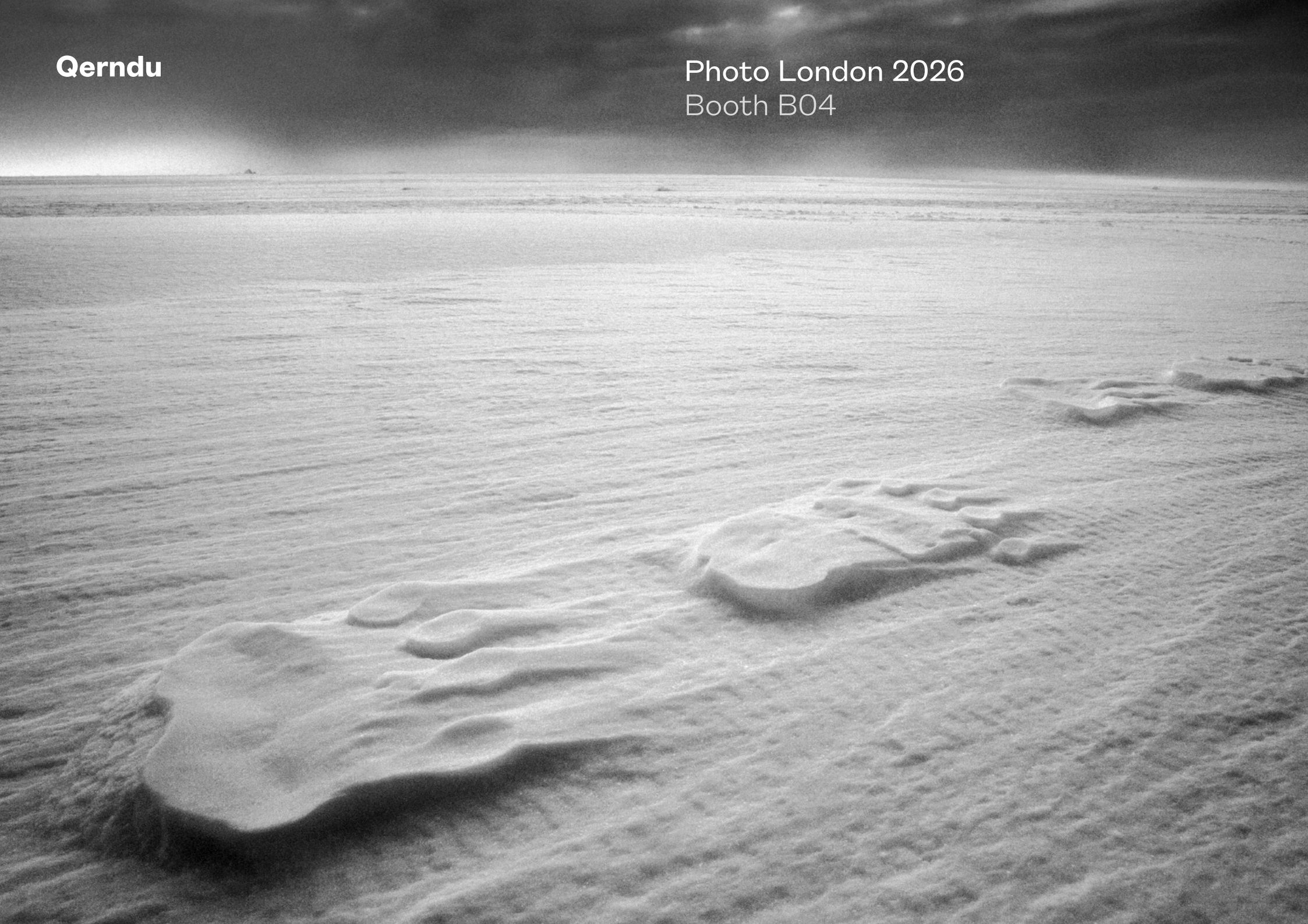
Photo London 2026 Booth B04